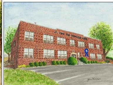
St. John School