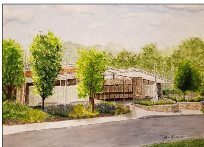
St. John Church